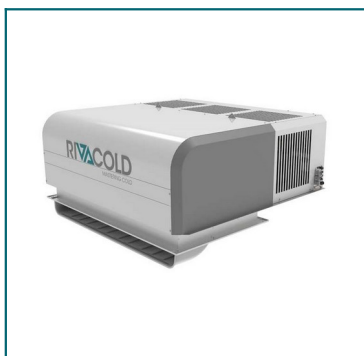
INDICATIVE PRODUCT IMAGE