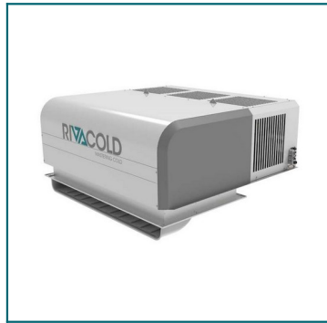
INDICATIVE PRODUCT IMAGE